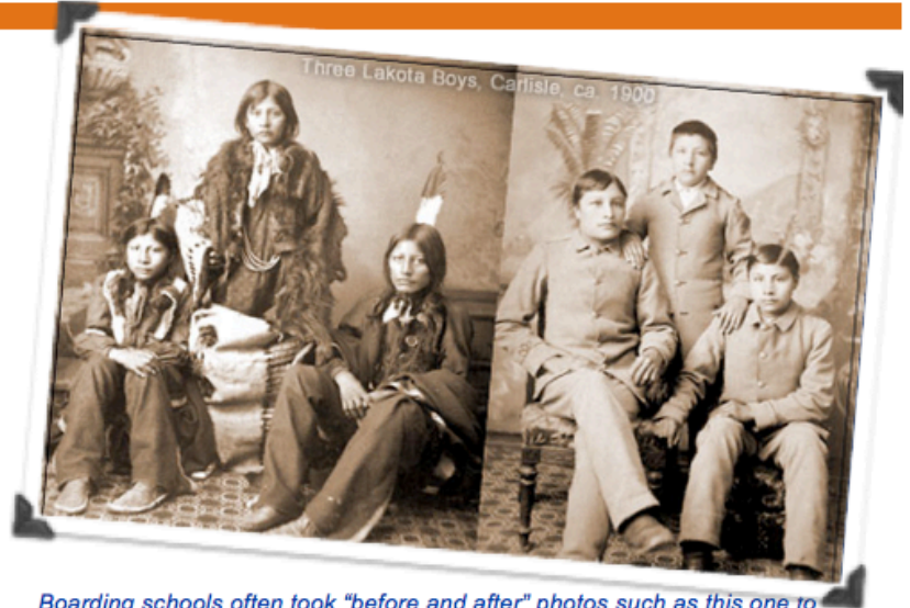
Boarding schools often took “before and after” photos such as this one to demonstrate the successful cultural assimilation of the children.