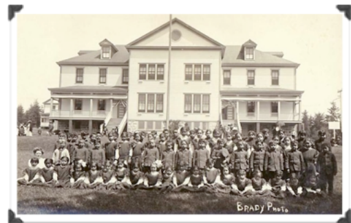
Students at Tulalip Indian School, 1912